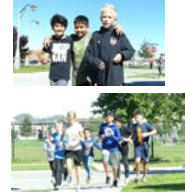
More Terry Fox Run!